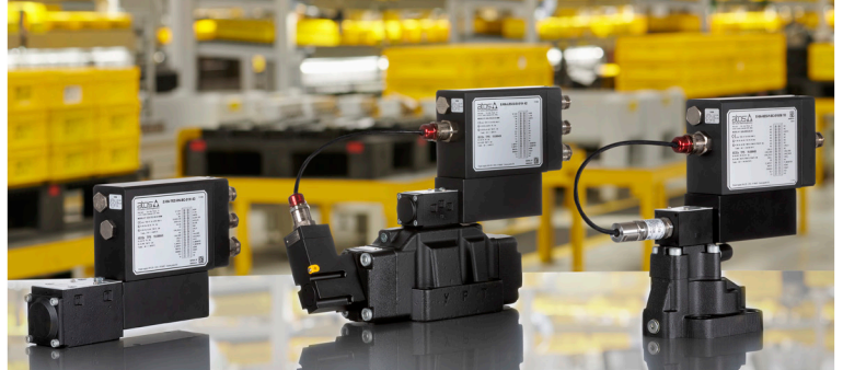
Atos ex-proof hydraulics

Improved corrosion resistance, heavy equipment handling and potentially explosive area: all the strict requirements typical of the energy and offshore sector are together combined in mooring systems for oil&gas vessels, for which ex-proof electrohydraulics represents the most widespread solution, meeting all the mentioned requirements, as well as ensuring high-performance controls and simple maintenance.