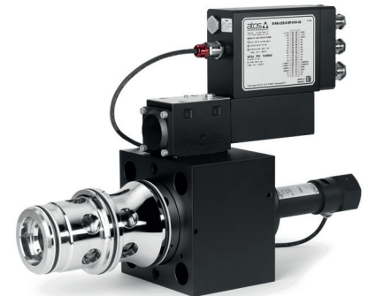
Ex-proof proportional valve

Explosion proof power units and hydraulic blocks designed for marine environments classified as hazardous locations are certified by TÜV, DEKRA, UL, CSA, ABS, BV, DNV GL, RINA: high production quality, strict compliance to customer specifications and specific marine painting cycles are only some of the key factors making Atos Systems Division the preferred hydraulic partner for the offshore sector.