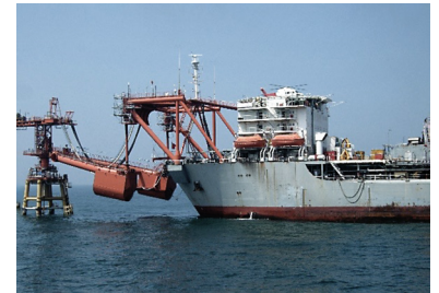
Tower Yoke Mooring System

Spread-mooring, tower systems and turret-type solutions: different executions are available on the market, but they all share the same key features, from the necessity to handle heavy equipment and strong forces - e.g. catenaries or winches -, to the strict requirements of the offshore oil&gas sector, such as the need for improved corrosion-resistance, the application of specific international norms and the mandatory use of explosion-proof certified products due to the presence of petroleum and gas. Ex-proof hydraulic systems are thus the most widespread solution for the actuation of mooring systems, as they meet offshore requirements with long-term operative life, allowing also to perform high-performance motion controls.